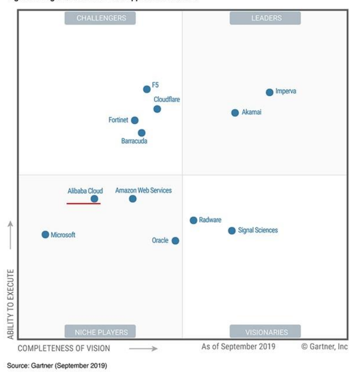
Figure 1. Magic Quadrant for Web Application Firewalls

encryption, cloud WAF protection, and website trusted identity validation service. Of course, cloud WAF protection needs to be integrated based on mature products on the market. So, we tested the products of several cloud WAF service providers. According to the official website of Alibaba Cloud WAF, "Alibaba Cloud WAF is the only product in China that has won the Web Application Firewall Grand Slam (Gartner, Forrester, IDC, Frost & Sullivan)". The author also searched for Gartner's WAF Magic Quadrant report, which is indeed as Alibaba's Cloud official website publicity - "Alibaba Cloud is selected in Gartner 2019 WAF Magic Quadrant, the only Asia-Pacific vendor". The author found the Magic Quadrant of the original report. The red line name Alibaba Cloud as shown in the figure below. Don't mind the definition of "Niche Players". Alibaba Cloud WAF in China is not a so-called "niche player", it is not surprising that Gartner puts Alibaba Cloud WAF in this category, because Gartner is not a Chinese company.